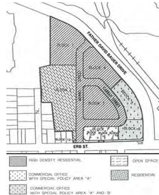
OPA No. 41 Designations

The Central Residential District Plan was amended at the same time as OPA 41 was approved. The designations in the District Plan are similar to those provided in the Official Plan. The majority of the site is designated in the Central Residential District Plan as High Density Residential and Medium Density Residential. The Erb Street and Father David Bauer Drive frontage is designated Commercial with a Special Commercial Policy Area CP6 which is the same as SPA 53 of the Official Plan.